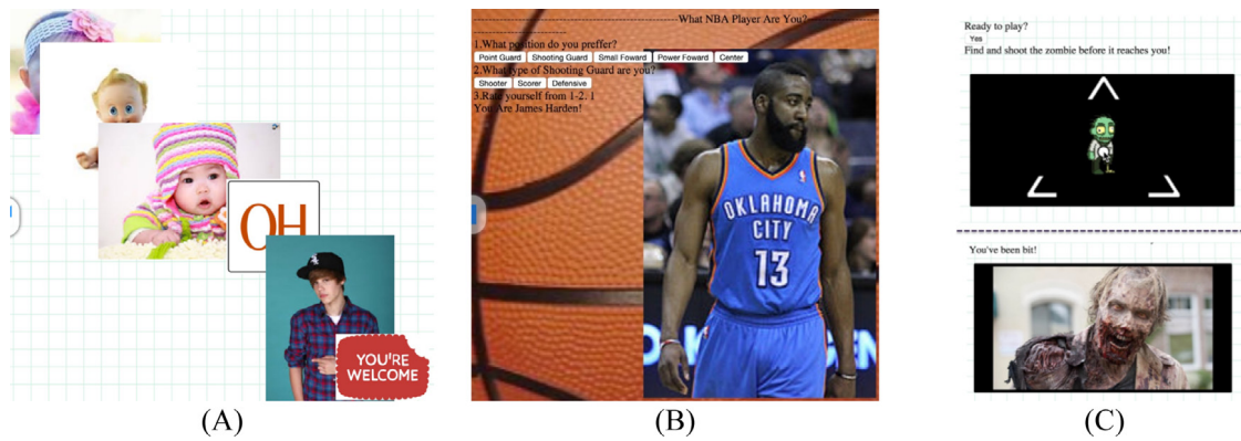
Fig. 2. Three examples of media-rich projects that incorporated resources for the Internet.