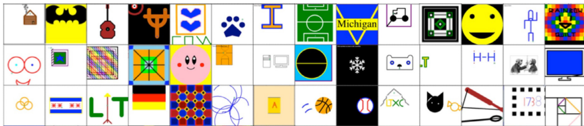
Fig. 3. A portion of the class quilt web page comprised of patches written by students.

projects submitted in the two settings, online resources shaped the assignment both in terms of the content of the projects themselves and in how students shared and discussed their work. For example, one student in the CT4G class decided to make her final project a recreation of her favorite Justin Bieber Song, “Baby”, by writing a program to animate the chorus of the song, which used iterative logic to move through various pictures of babies pulled from the Internet and culminated in a picture of Justin Bieber and a sign saying “You’re Welcome” (Fig. 2A). When the class was given a chance to share their work at the end of the last day of the Pencil Code unit, this student eagerly volunteered to present her project, getting the class to join in and sing along with her and her program.