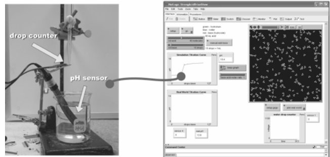
Figure 3: A Typical NetLogoLab Experiment.

modify the physical agents and try out different ideas for sensing and control. Figure 3 illustrates a typical NetLogoLab experiment.