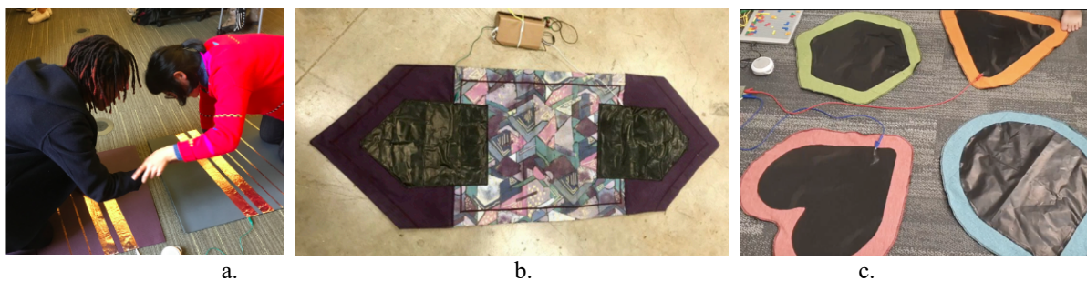
Figure 2. MMM design evolution: (a) Prototype 1: two users, who are each standing on a yoga mat overlaid with copper strips, spontaneously interact to produce emergent musical effects. (b) Prototype 2, equipped with velostat capacitors sewn onto fabric. (c) Prototype 3, a modular design increases affordance versatility.

The third prototype of MMM was modified as adaptable to different physical spaces—small or big—by creating several modular capacitive sensors that can be either pulled apart or placed close together (Figure 2c). This modification creates new interaction possibilities: (1) more than two people can now interact on the mat; (2) users can exercise agency in pulling the mats closer or further apart for different interactions; and (3) the flexibility of the design allows it to be used in different physical spaces. Prototype 3 affords new interaction dimensions to sound expressivity for our next iteration, such as accommodating multi-party interactions or augmenting the scope of touch-based gestures per distance between users. In turn, these new user affordances create new research affordances, such as investigating how architectural dimensions of artifact configurations effect modes of social interaction. Through our work with the autism clinic, we also noted the emergence of rhythmic hand games in the students' interactions. In our next iteration, we plan to include new hard/software functionalities for the augmentation of rhythmic gestures with percussion sounds that will be added to MMM's expressivity repertoire.