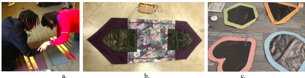
Figure 2. MMM design evolution: (a) Prototype 1: two users, who are each standing on a yoga mat overlaid with copper strips, spontaneously interact to produce emergent musical effects. (b) Prototype 2, equipped with velostat capacitors sewn onto fabric. (c) Prototype 3, a modular design increases affordance versatility.

The third prototype of MMM was modified as adaptable to different physical spaces—small or big—by creating several modular capacitive sensors that can be either pulled apart or placed close together (Figure 2c). This modification creates new interaction possibilities: (1) more than two people can now interact on the mat; (2) users can exercise agency in pulling the mats closer or further apart for different interactions; and (3) the flexibility of the design allows it to be used in different physical spaces. Prototype 3 affords new interaction dimensions to sound expressivity for our next iteration, such as accommodating multi-party interactions or augmenting the scope of touch-based gestures per distance between users. In turn, these new user affordances create new research affordances, such as investigating how architectural dimensions of artifact configurations effect modes of social interaction. Through our work with the autism clinic, we also noted the emergence of rhythmic hand games in the students' interactions. In our next iteration, we plan to include new hard/software functionalities for the augmentation of rhythmic gestures with percussion sounds that will be added to MMM's expressivity repertoire.